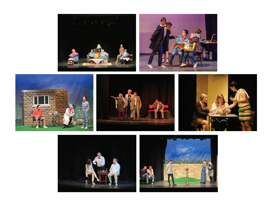
Past performances from the SCDA Edinburgh District Festival.